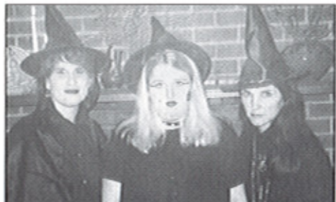
Macbeth's witches drop in on LIT Halloween party.