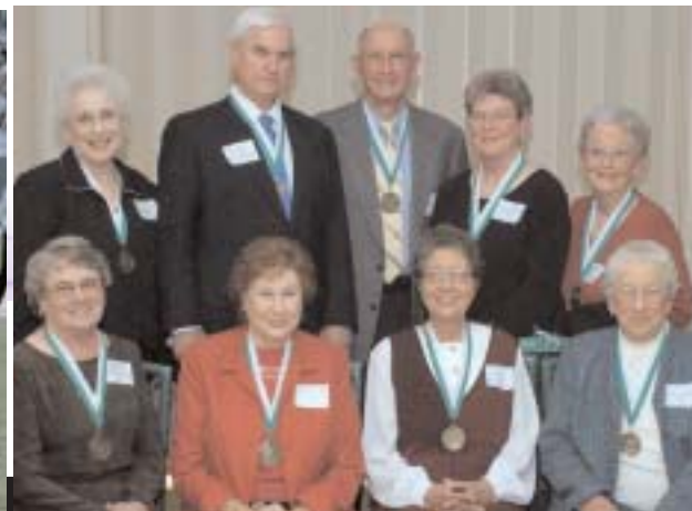
Left: Homecoming Queen 2004. Above: Golden Circle 2004.