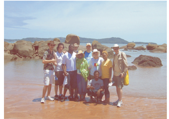
Taken on the island of Kassa

Weekend excursions were taken to the island of Kassa off the coast of Conakry and to the beautiful mountain region of Kindia. Other highlights of the trip include a tour of the military compound that houses the offices of the president and vice president of Guinea and a trip to the United States Embassy in Conakry. Prior to their arrival in Guinea, the group spent a weekend touring the beautiful city of Paris, France.