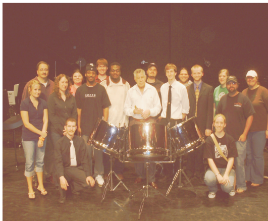
Dr. Ellie Mannette (center), “Father of the Steel Drum”

Highlights from the year include a steel band performance at the 2009 Mississippi Day of Percussion held at Jackson State University in March. The spring tour included performances at Pearl River Community College, Columbia High School, Copiah Lincoln Community College, and North Pike High School. The ensemble also performed at the Goombay Caribbean Festival in Pensacola Florida on Saturday, April 25, and Sunday, April 26, 2009. The DSU steel band shared the stage with other groups from USM, University of Florida, University of Georgia, University of Mississippi, and Florida State University.