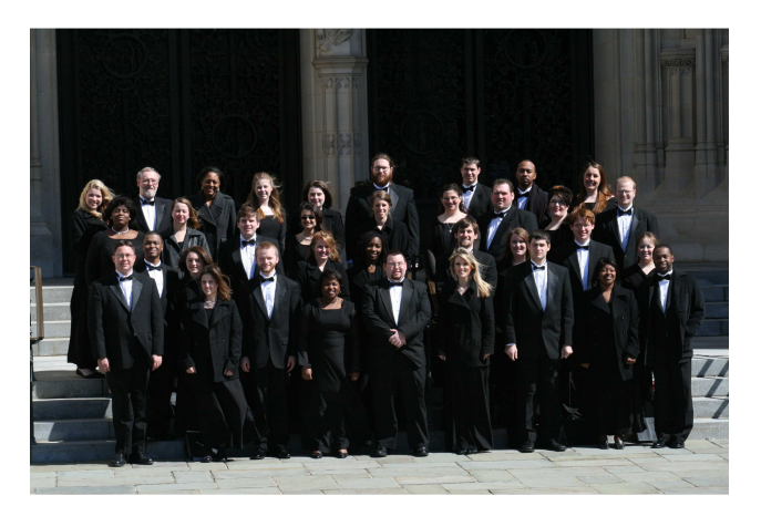
Chorale on steps of Washington National Cathedral