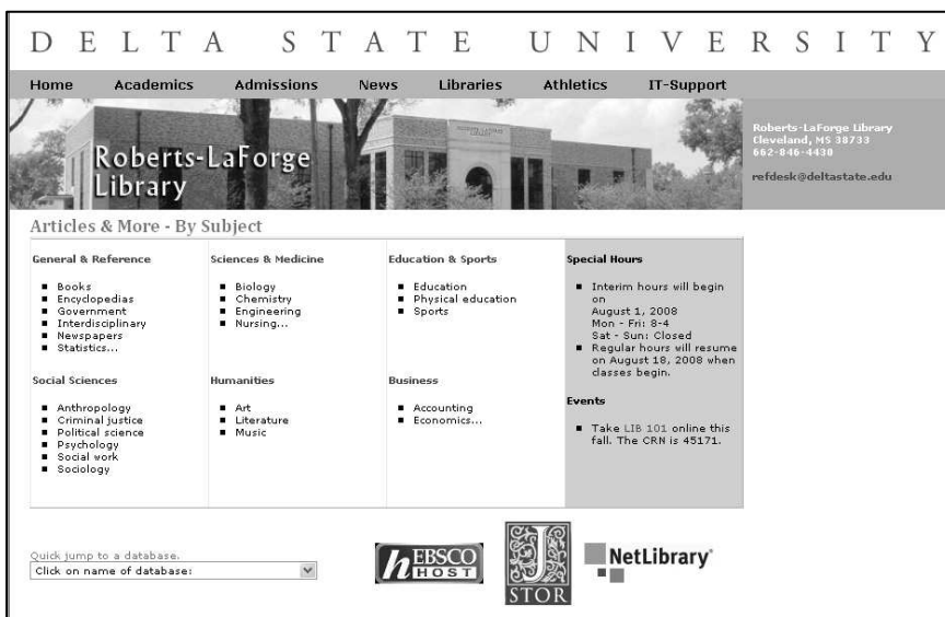
Figure 1 – Articles & More web page →