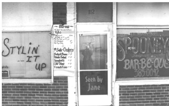
Exhibit Opening and Reception Sunday, 16 November 2008 2:00 - 4:00 pm Capps Archives & Museum Delta State University

Jane Kerr is an extremely talented photographer who has captured elements of life in the Delta through a series of intriguing photographs. This collection of images will be on display in the Archives' main gallery from 16 November through 16 January 2009.