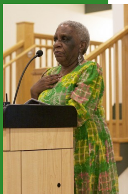
Margaret Block, Civil Rights Activist