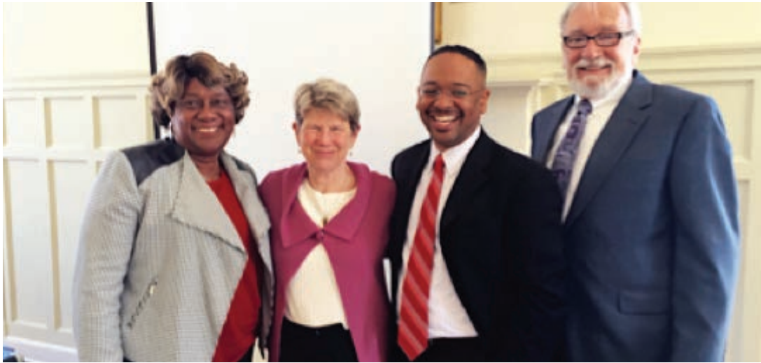
Community leaders pose for the camera following a productive Lunch and Learn session.