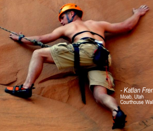
- Katlan French Moab, Utah Courthouse Wall