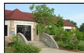
Above is the home of the Robert E. Smith School of Nursing on the campus of Delta State.