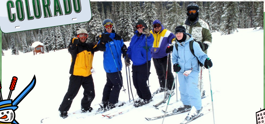
PER 492/545 - Downhill Skiing/Snowboarding