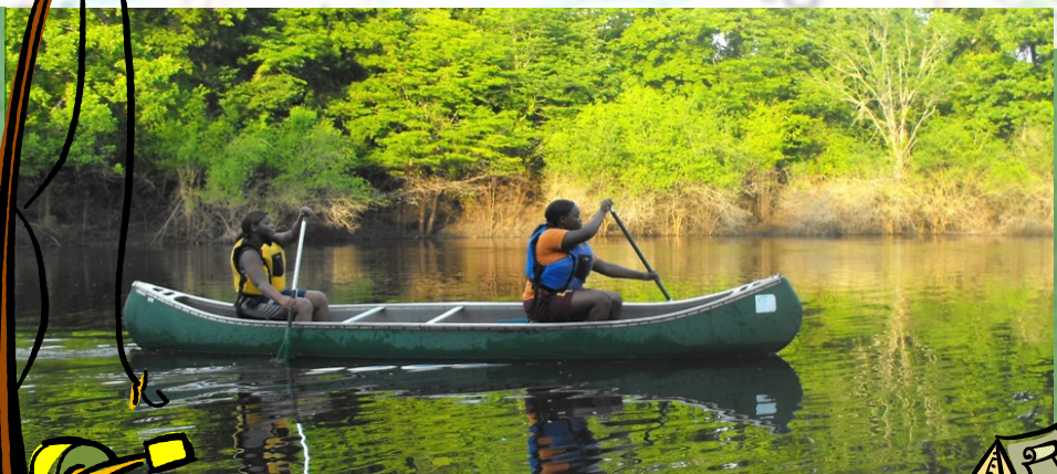
PER 190 C71 - Wilderness Activity