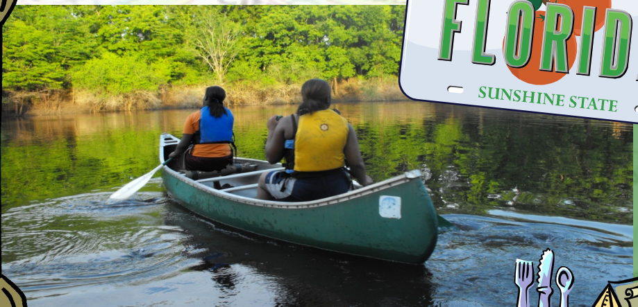
PER 445/545 C71 - Outdoor Education