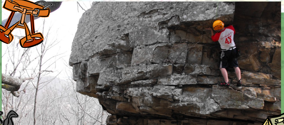
PER 190 C70 - Wilderness Activity