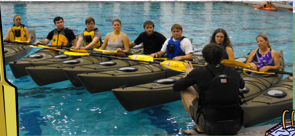
PER 190 C01 - Wilderness Activity