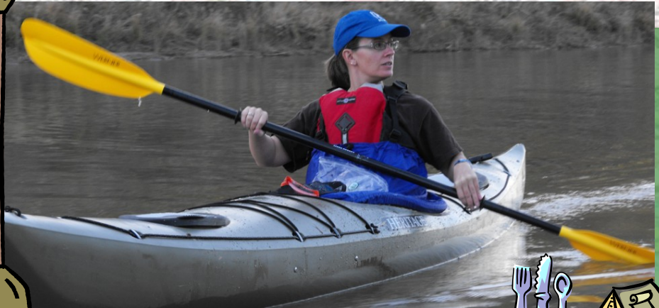
PER 445/545 C72- Outdoor Education

Horn Island Kayak: (3cr.) Ocean Kayak to Horn Island in the Gulf of Mexico. Hike, fish & Explore. Dates: Oct 14-18 (Fall Break) Pre-Trip Meeting: TBA Fee: $150 Allowance: 12 Sign Up: HPER, 846-4570 or tdavis@deltastate.edu CRN—46191