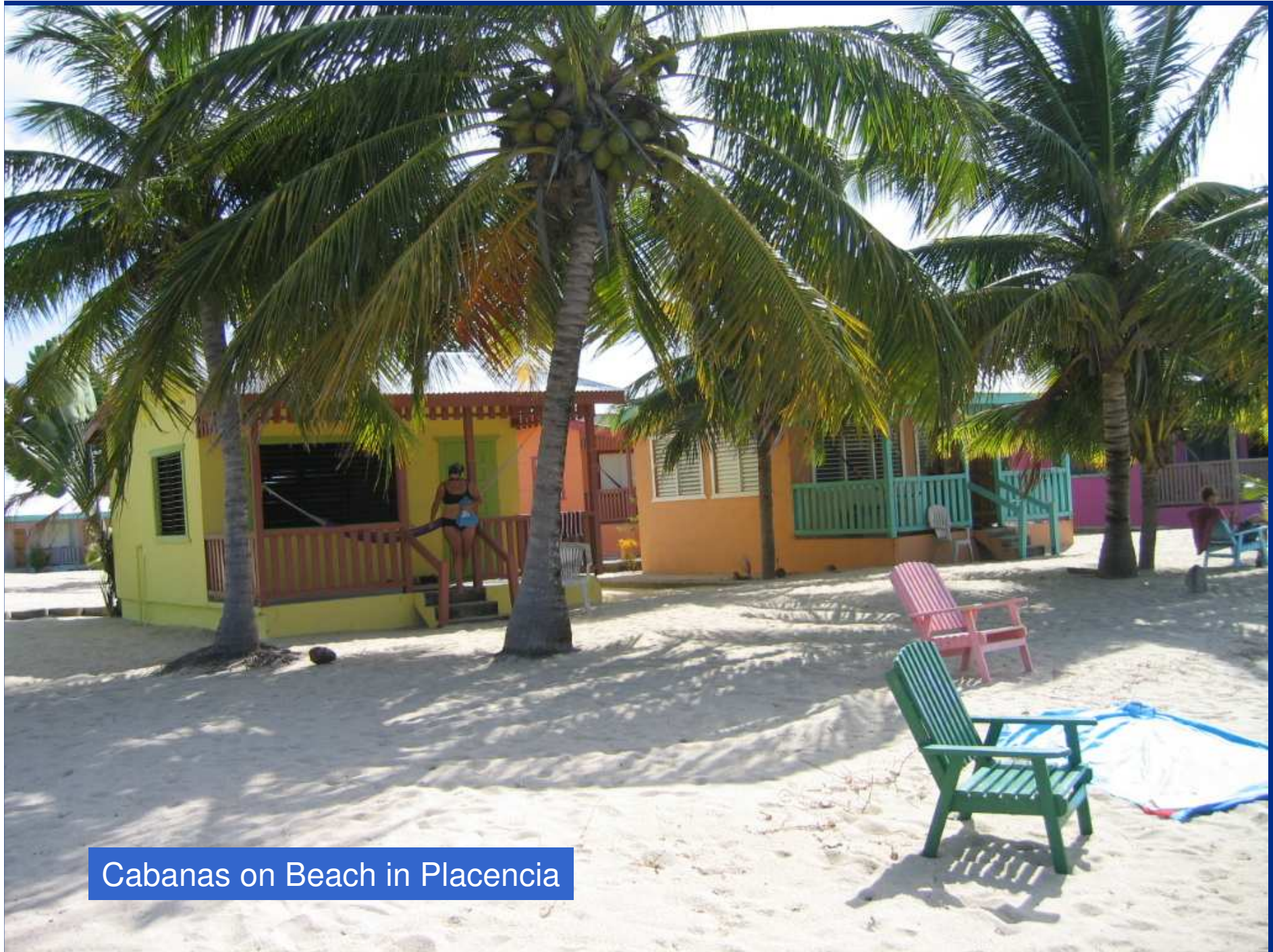
Cabanas on Beach in Placencia