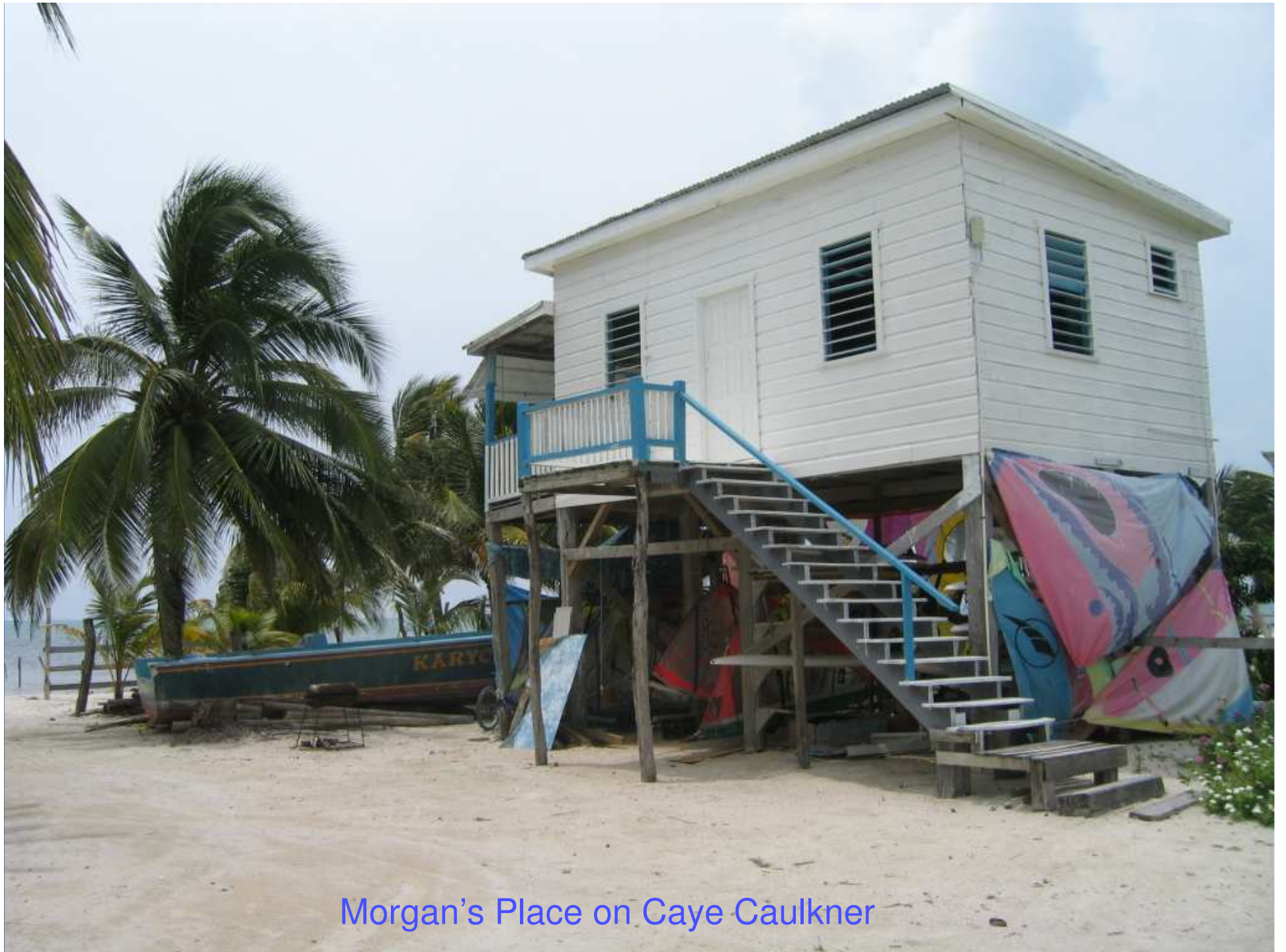
Morgan's Place on Caye Caulkner