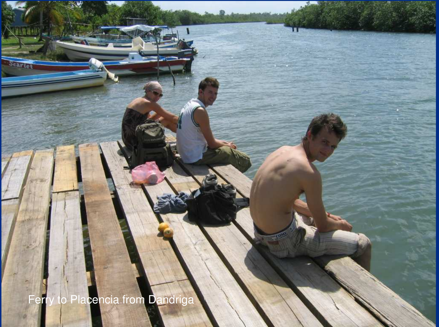
Ferry to Placencia from Dandriga