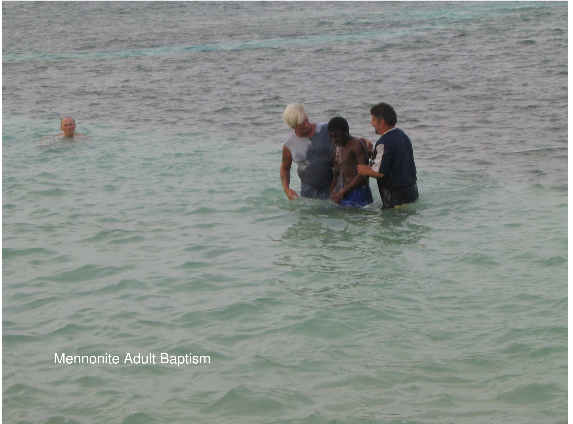
Mennonite Adult Baptism