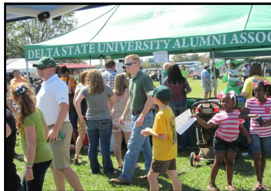
Statesmen Park Activities