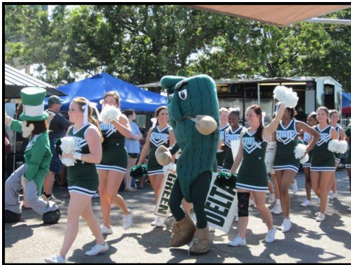
Pep Rally 2012