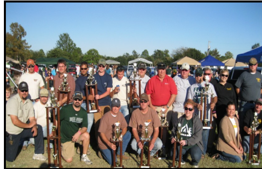
Cook Team Competition