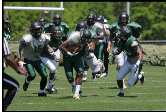
Statesmen Football Team